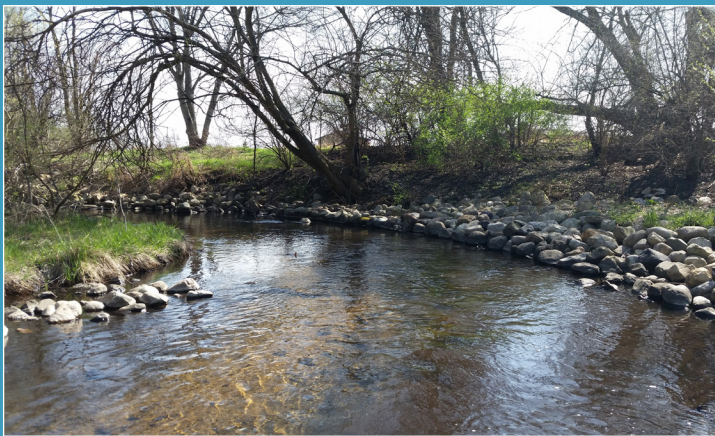
Cobus Creek at Cobus Creek County Park Elkhart County, Indiana

Cobus Creek is a winding, scenic creek that flows south from southern Cass County, Michigan through Elkhart County before draining into the St. Joseph River, near the Elkhart Conservation Club. The majority of the residents in the watershed live adjacent to the creek or one of several lakes located in Cobus Creek's headwaters. The creek and its tributaries are held in high regard by watershed stakeholders given its natural meandering appearance, extensive wetland complexes, and diversity of sport fish species, including a natural producing population of brown trout. These are just a few reasons why there has been a significant interest among landowners and other stakeholders of Cobus Creek to better understand the health of their watershed and how they can better preserve Cobus