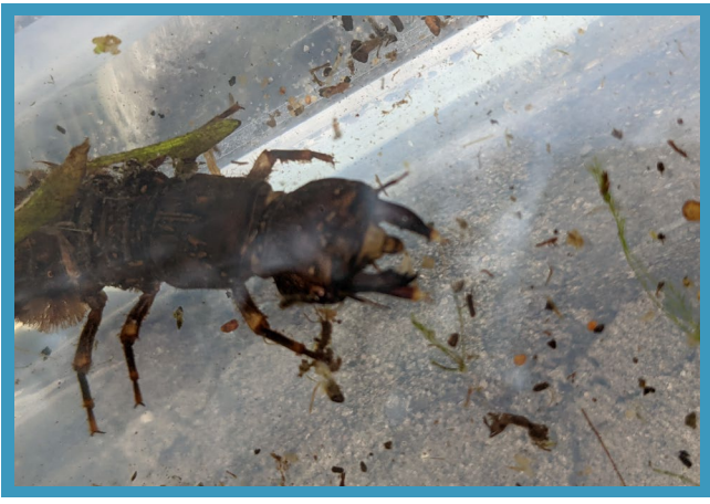
A Hellgrammite, an indicator of good water quality, collected from the Coldwater River.

The Commission has also begun working on compiling and interpreting existing water monitoring data collected by partners on both sides of the basin. An exciting new project is underway to build an interactive web map that will host monitoring data throughout the basin and serve as an educational tool for anyone who wants to know how the water is doing.